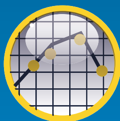
Risk Assessment & Modelling