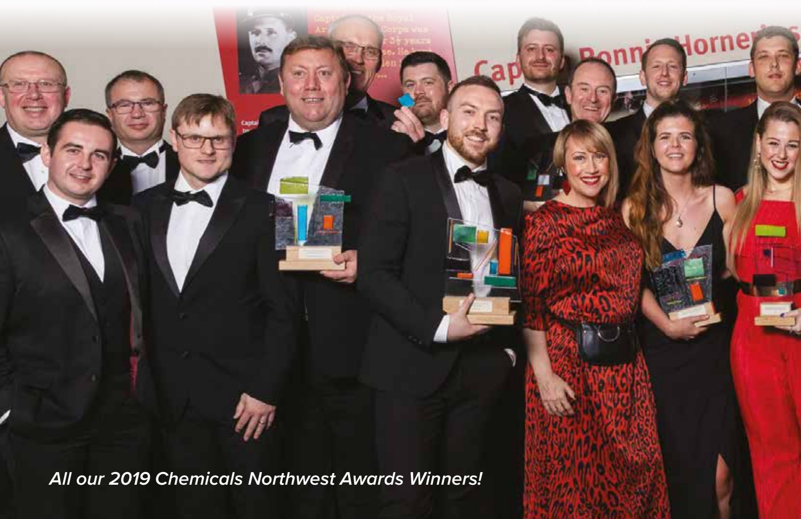
All our 2019 Chemicals Northwest Awards Winners!