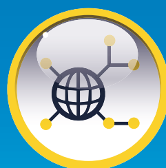
Global Chemical Notification