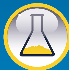
Analytical & Product Chemistry