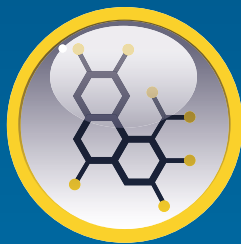
Plant & Animal Metabolism