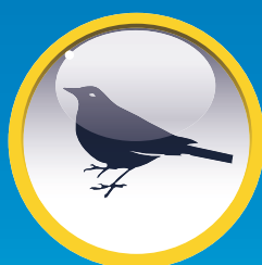
Avian, Wildlife & Mammalian Toxicology